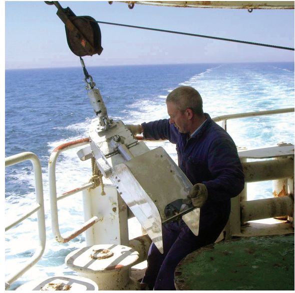
Deploying the Continuous Plankton Recorder from the ship "Pride of Bilbao"